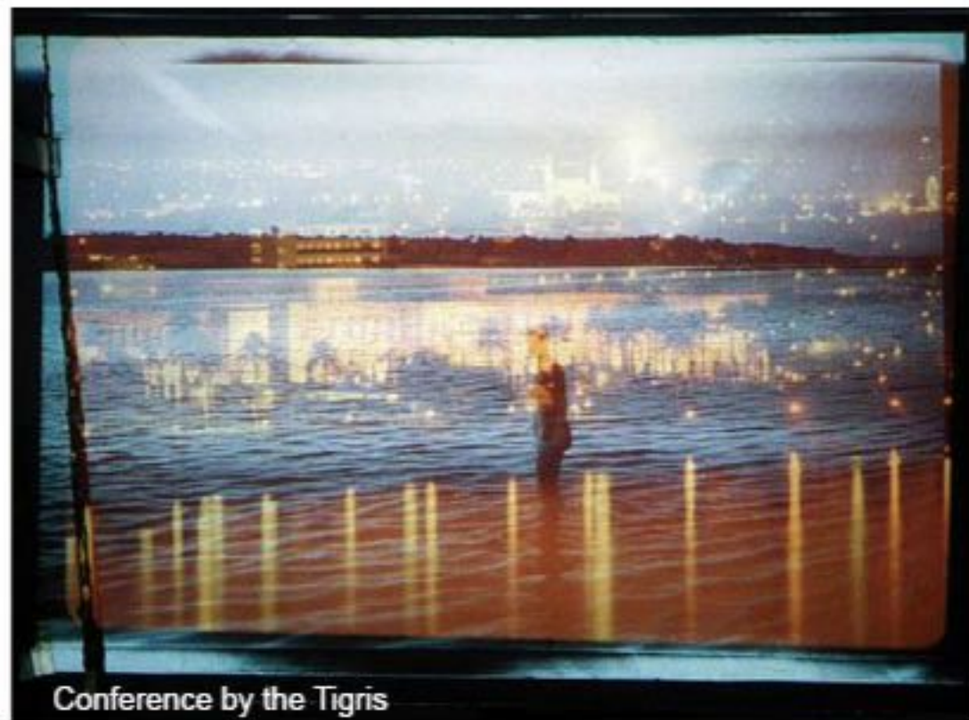
Conference by the Tigris