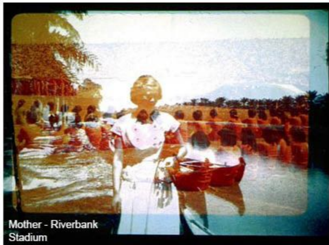
Mother - Riverbank Stadium